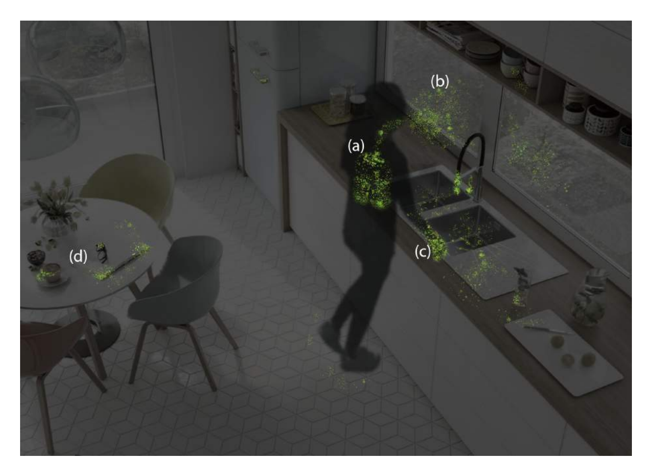
Figure 2: Conceptualization of SARS-CoV-2 deposition. (a) Once infected with SARS-CoV-2, viral particles accumulate in the lungs and upper respiratory tract (b) droplets and aerosolized viral particles are expelled from the body through daily activities such as coughing, sneezing, talking, and non-routine events such as vomiting, and can spread to nearby surroundings and individuals <sup>33,38</sup> (c) Viral particles, excreted from the mouth and nose, are often found on the hands and (d) can be spread to commonly touched items such as computers, glasses, faucets, and countertops. There are currently no confirmed cases of fomite-to-human transmission, but viral particles have been found on abiotic BE surfaces <sup>33,37,37,40</sup>.

Previously, it has been confirmed that SARS can be, and is most often, transmitted through droplets<sup>42</sup>. Considering that SARS-CoV-2 is from a sister clade to the 2002 SARS virus<sup>43</sup>, that is